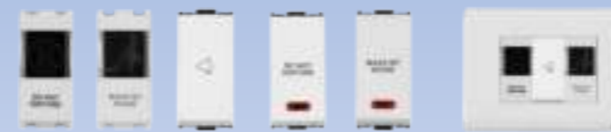
For Outside The Room For Inside The Room Final Look Outside The Room