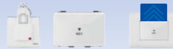
60289 60202 Final Look Inside The Room